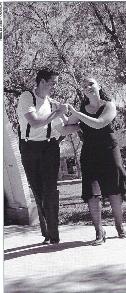
Swing dancing at Founders' Weekend