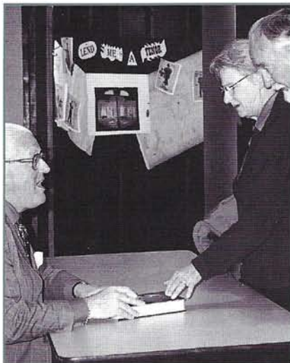
Lord John Julius Norwich lectured and signed books.