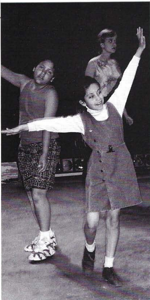
Students from Alvord Elementary School at the Greer Garson Theatre.