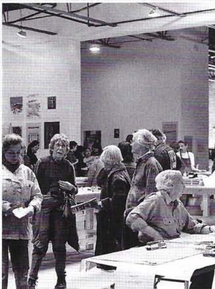
Monothon at Site Santa Fe

Several of the college's advisory councils staged very successful benefit events during the past year. The Visual Arts Advisory Council presented the twelfth annual Monothon, resulting in income of more than $69,000. For the third year SITE Santa Fe provided the venue for the event renewing a successful collaboration with one of the community's premiere arts organizations.