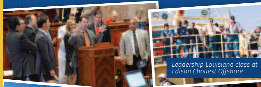
Leadership Louisiana class at Edison Chouest Offshore